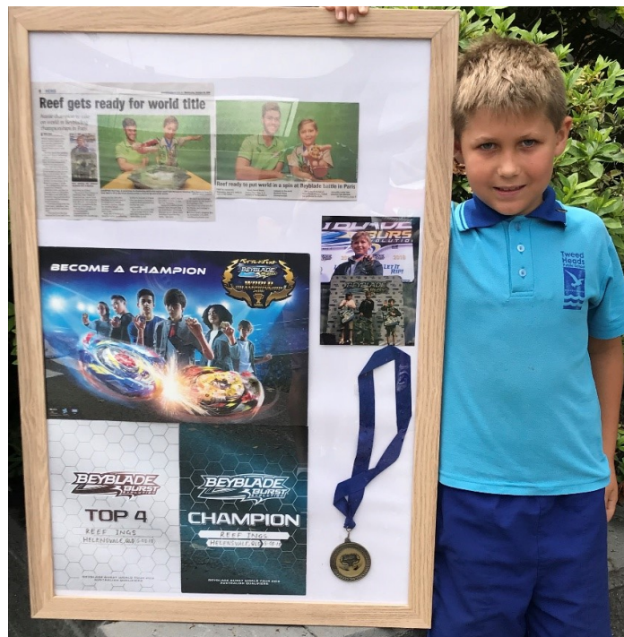
Bon voyage Reef