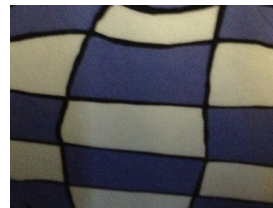
Photograph by Maxson (4/5W)