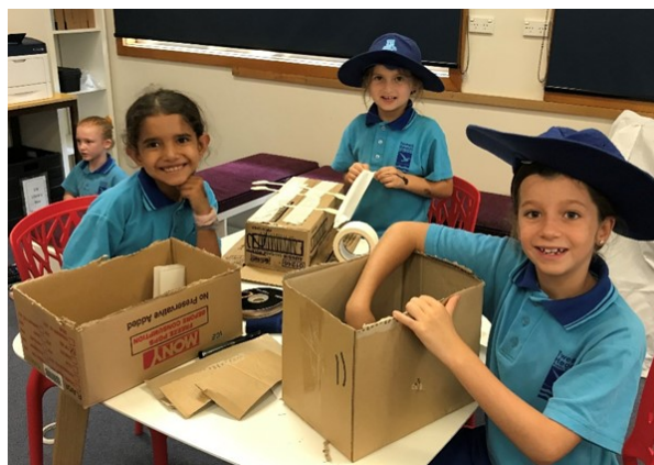
Your trash is our treasure