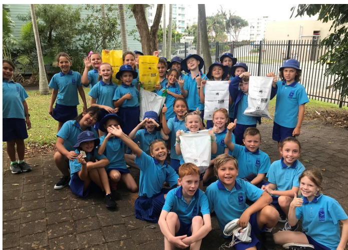
The Clean Machine